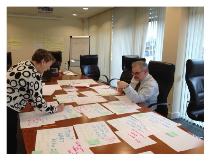
Figure 2 Intervening through 'Making' in action

My current work has developed from my practice and I am considering how sustainable interventions can be made.